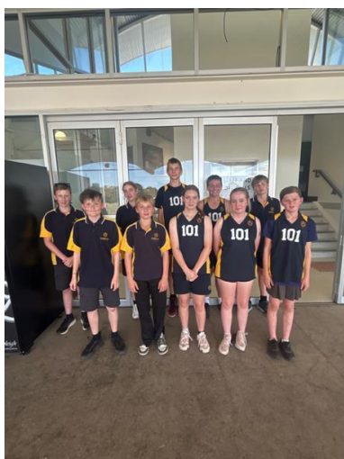
Secondary Athletics, Years 7-9 (Adelaide) students attended