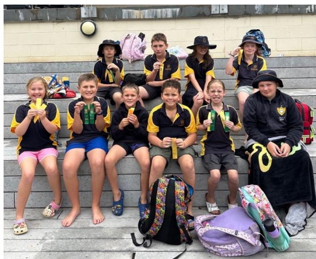
Catholic Swimming (Clare) Years 3 – 6, 10 students attended

This term the students at St Joseph's School have had numerous wonderful sporting opportunities. The whole school was involved in Sports Day during Week 7 and many students have attended sporting events at venues outside of the school. Some of the events our students have attended are: Catholic Swimming, Secondary Athletics, SAPSASA Basketball, SAPSASA football trials, SAPSASA netball trials and the Tee ball Carnival.