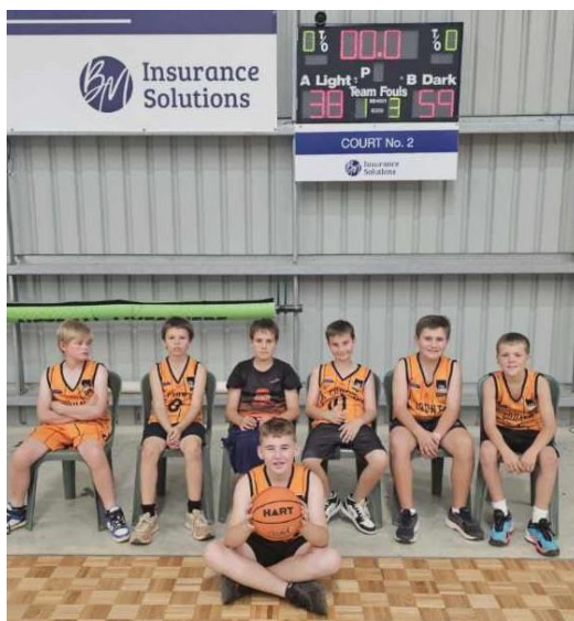
SAPSASA Basketball (Jamestown) Year 4/5/6 Boys won the Carnival