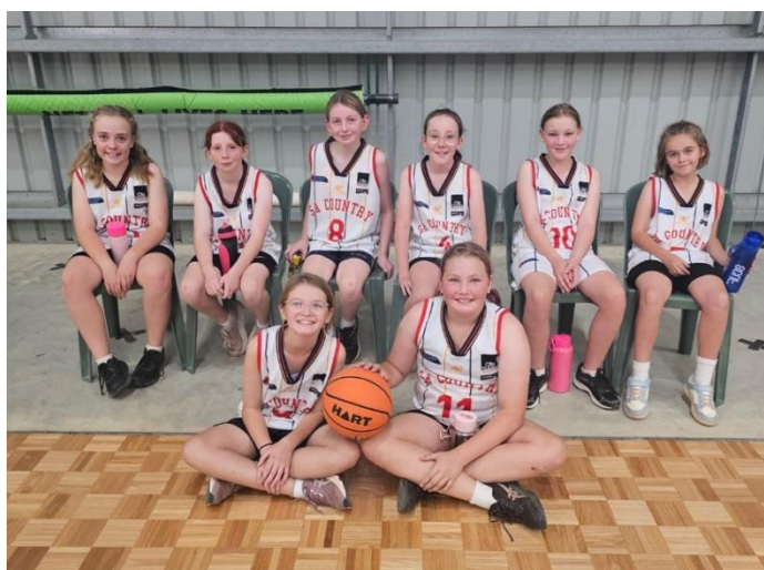
SAPSASA Basketball (Jamestown) Year 5/6 Girls Team