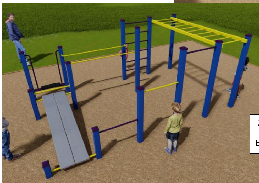
2 nd play space – fitness design. Includes: chin up bar, push up bar, parallel bars & sit up bench