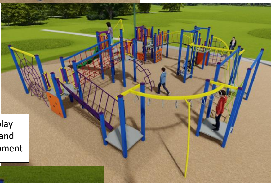
Another angle of main play space – lots of climbing and upper body strength equipment