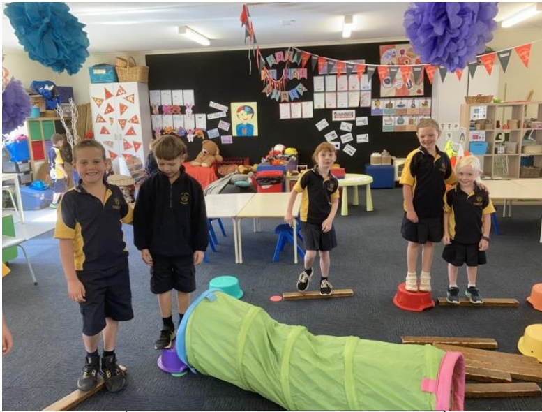
It was fun to make an obstacle course during investigations.

Term 4 is off to a flying start in the Reception and Year 1 classroom. The students have already learnt so much in a short space of time.