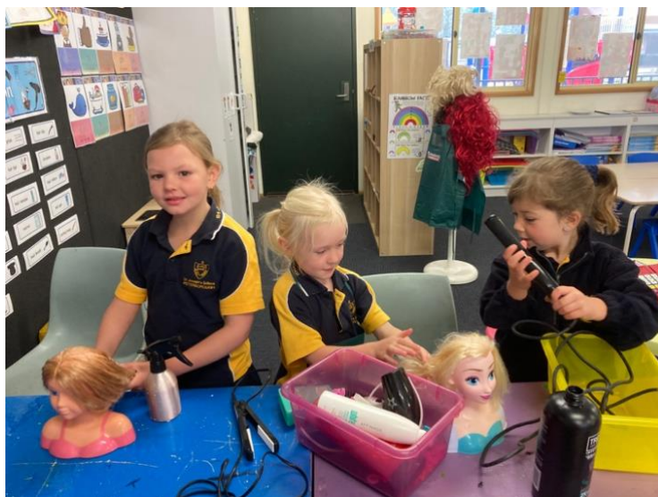
Fun at the Hair Salon during Investigations

During Investigations, the students have enjoyed making houses, cards, loom band bracelets, participate in sensory activities like playing with the kinetic sand and playdough. As a part of dramatic play, the students have been shopping at 'Bunnings' and have played hairdressers.