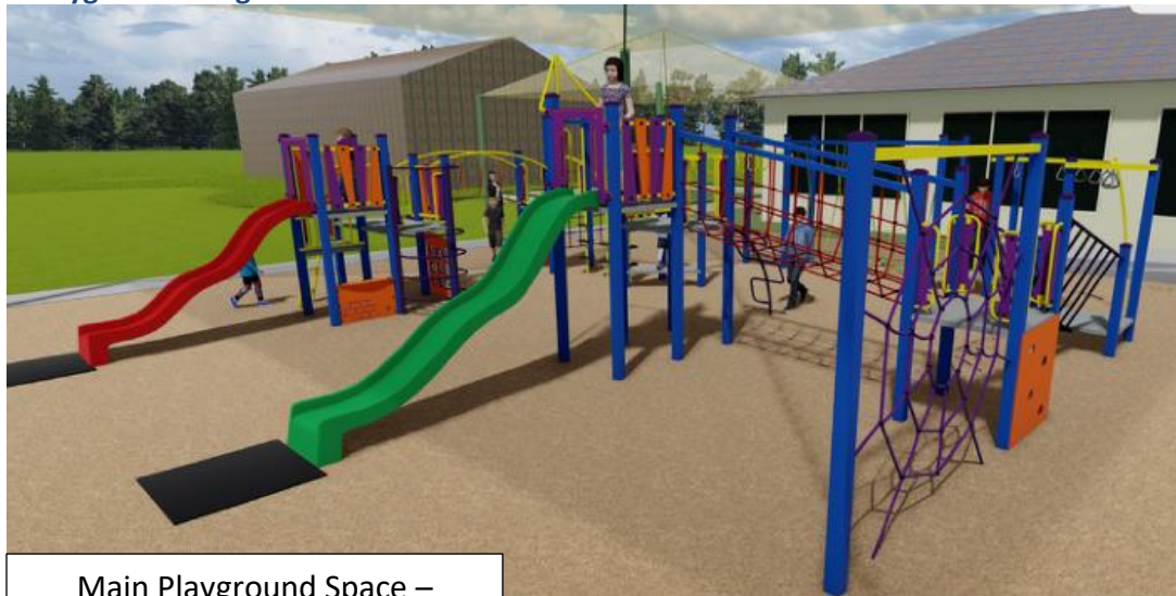
Main Playground Space – replacing current play space outside R/1 Class