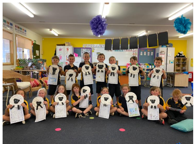
We are very proud of our pieces of writing!