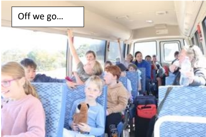
Off we go...