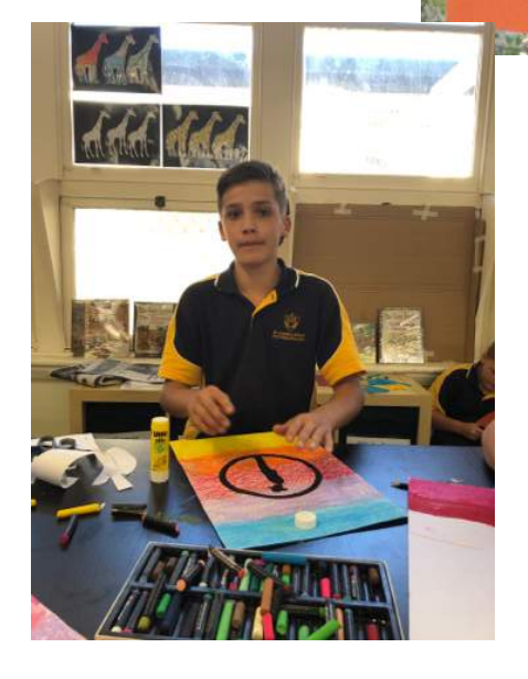
5/6/7 Anzac Art