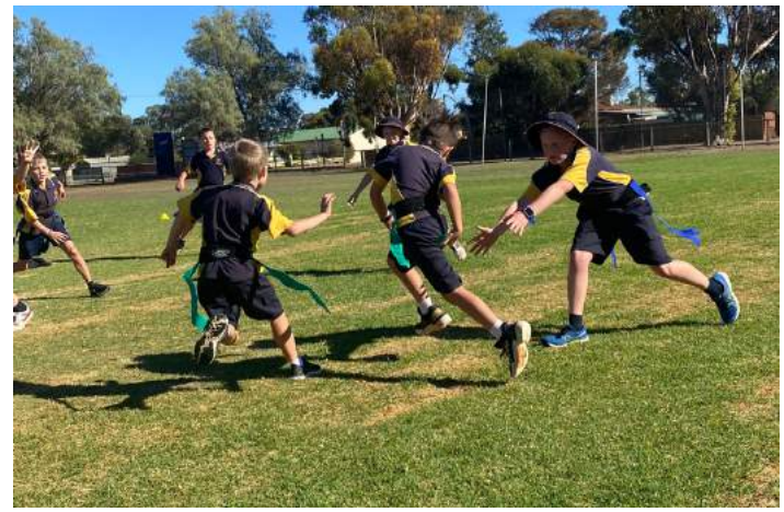
Year 2/3/4 Flag Tag

Term 1 has been a very active time for all students. The focus from R-7 has been on basketball, athletics and team games. The students have been working on good sportsmanship through preparing for Sports Day and many other games.