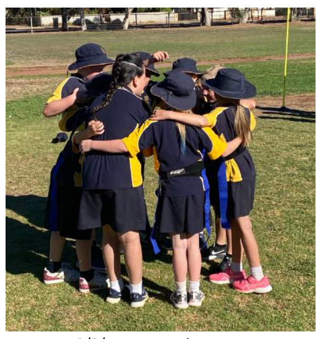
Year 2/3/4 Team Work