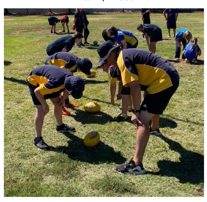
Year 5/6/7 AFL