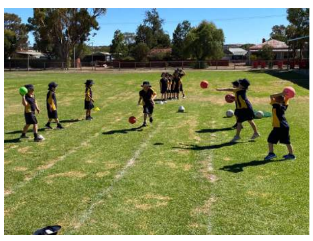
Year R/1 Poison Ball