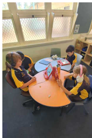
Listening to stories on story box library