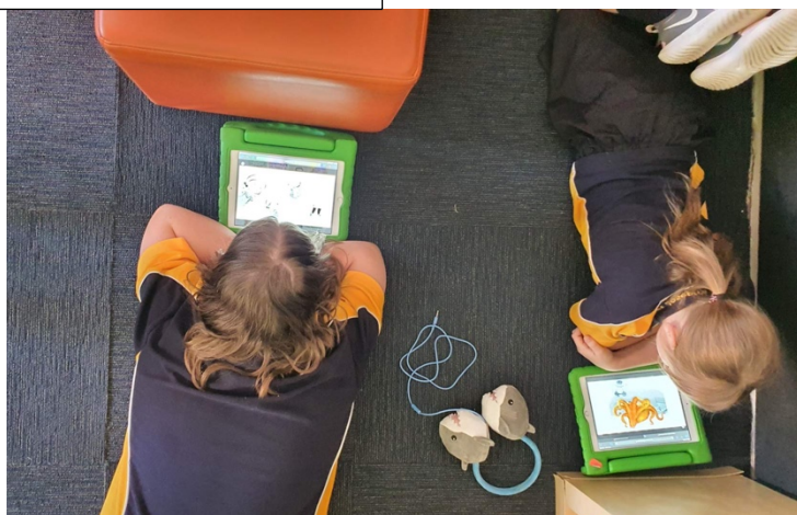
Reading books on 'Wushka'